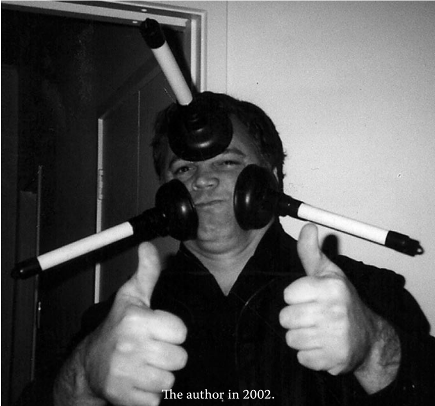
The author in 2002.

New Zealand certainly has the oil to warrant this happening.