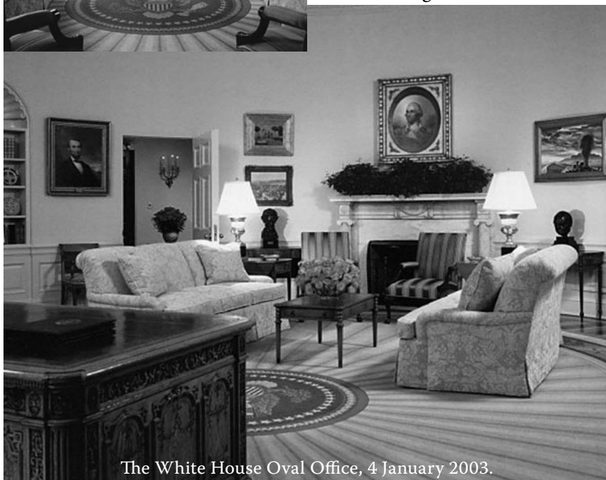
The White House Oval Office, 4 January 2003.

“After Prime Minister Helen Clark’s sex with the lesbian CIA pillow-talker, George Bush rang her up the next day and invited her to the Oval Office. Helen turned up, feeling great about her latest fisting, but wondering why she no longer had any control over her bladder, and George, not being the great diplomat, showed Helen the photos and asked her if she would like these to go to the media.